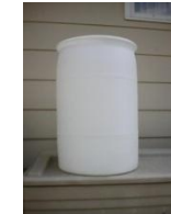
General Purpose Barrel