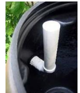
Wide over flow Upgrade