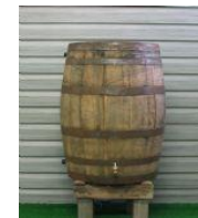
Oak Rain Barrel