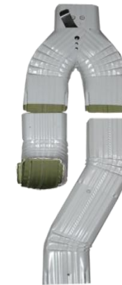
Downspout Off-set Diverter