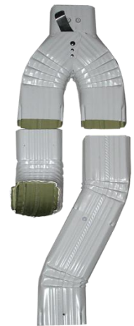
Downspout Off-set Diverter