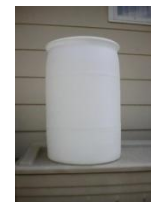
General Purpose Barrel